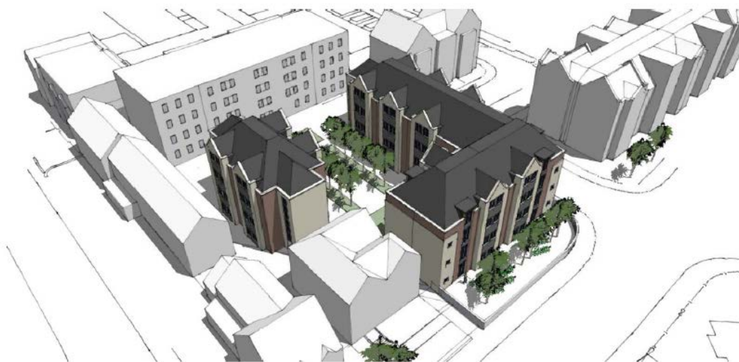
INDICATIVE VIEW OF CORNER COWLEY ROAD WITH GLANVILLE RD