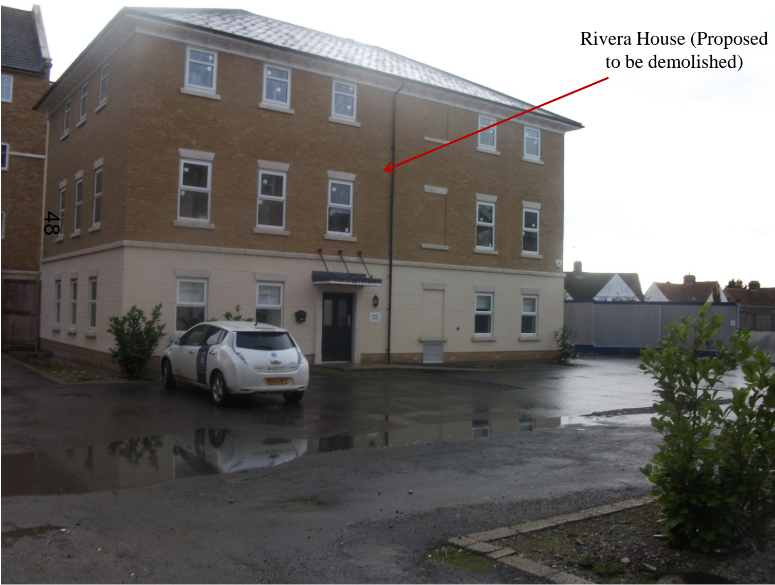
Rivera House (Proposed to be demolished)