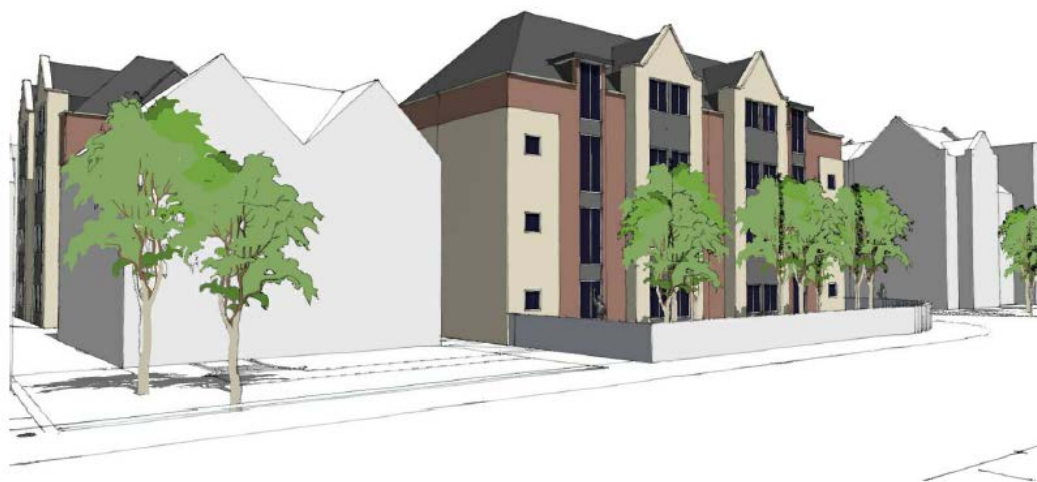
INDICATIVE VIEW FROM COWLEY ROAD