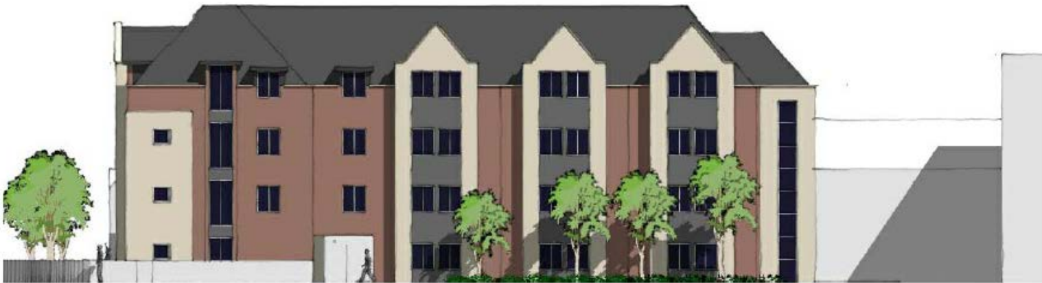
INDICATIVE ELEVATION TO RELIANCE WAY (1:200)