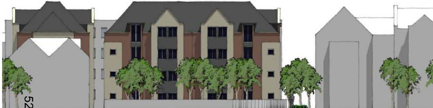
INDICATIVE ELEVATION TO COWLEY ROAD (1:200)