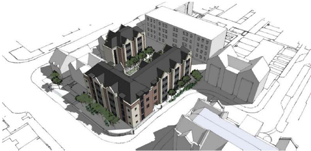
INDICATIVE VIEW OF CORNER COWLEY ROAD WITH RELIANCE WAY