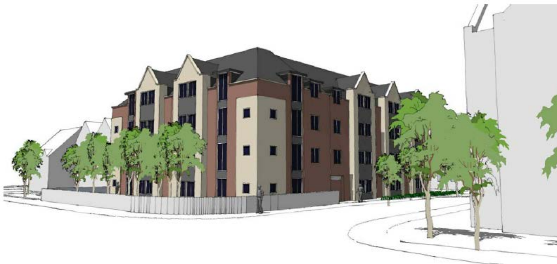
INDICATIVE VIEW OF RELIANCE WAY JUNCTION WITH COWLEY ROAD